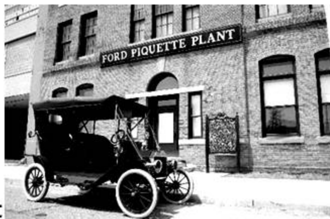
Built in 1904 (National Historic Landmark 2006)